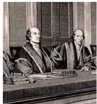
Early Supreme Court Justices relied on God's Natural Law to mete out justice and wisdom in ruling cases.

— James Wilson , Original Signer and Supreme Court Justice