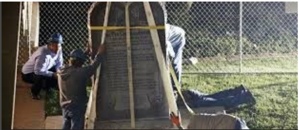
Documents such as our national motto and parts of the Constitution are being removed, as well as the dismantling of The Ten Commandments on public property. (Photo, NY Times)