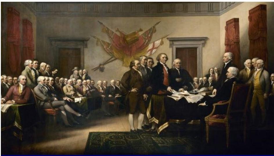
Painting by Trumbull: The Signing of the Declaration of Independence