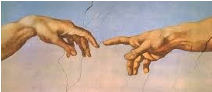
Like Michelangelo's portrayal of Adam receiving life from God, our Founding Fathers took their rights and laws directly from God.