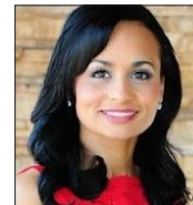
□ Katrina Pierson is Trump's National Spokesperson . She was most recently the Spokesperson for the Tea Party Leadership Fund.

digital consultant on the Cruz for President campaign.