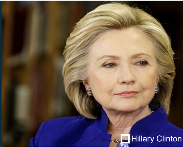
□ Hillary Clinton

Pray for the people behind the Clinton Campaign.