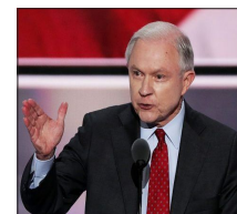
□ Jeff Sessions is Trump's National Security Chair . He was the first U.S. Senator to endorse

Trump during the primaries and has advised him on a number of issues.