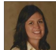
□ Sarah H. Sanders is Trump's Senior Advisor . She has experience working for her father, Mike Huckabee, as well as for other candidates.