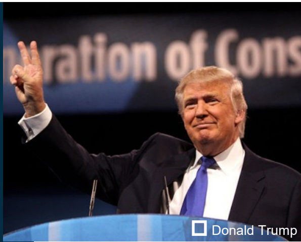
□ Donald Trump

Pray for the people behind the Trump Campaign.