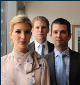
□ Ivanka Trump, Eric Trump, and Donald Trump, Jr.

Pray for the people behind the Trump Campaign.