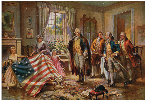
"The Birth of Old Glory" oil painting by Percy Moran, 1917